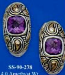
SS-90-278 4.0 Amethyst Wt. $215