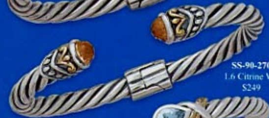
SS-90-270 1.6 Citrine Wt. $249