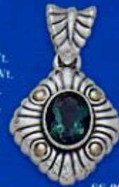
SS-90-279 2.25 Green Quartz Wt. $97