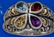
SS-90-273 .68 Amethyst Wt. .90 Blue Topaz Wt. .68 Citrine Wt. .73 Garnet Wt. $120