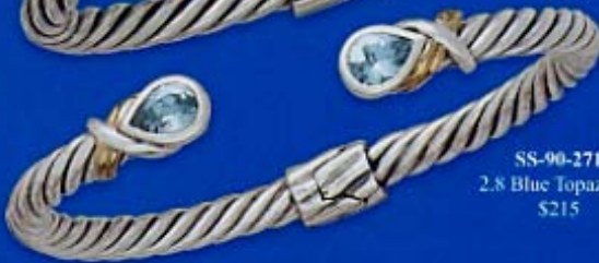
SS-90-271 2.8 Blue Topaz Wt. $215