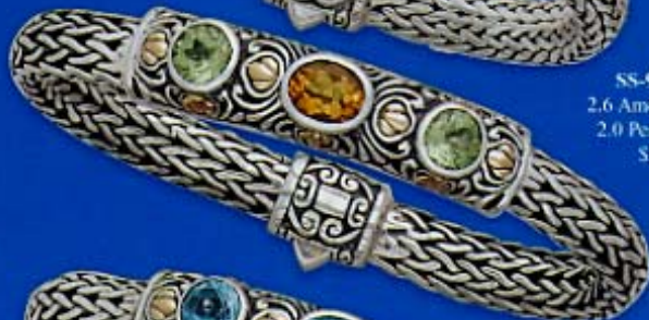
SS-90-274 2.6 Amethyst Wt. 2.0 Peridot Wt. $240