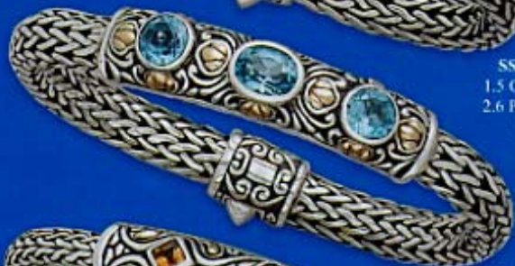
SS-90-275 1.5 Citrine Wt. 2.6 Peridot Wt. $227