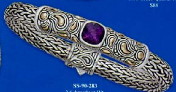
SS-90-283 2.6 Amethyst Wt. $335