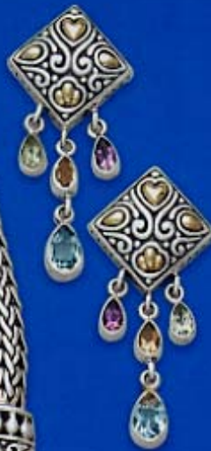
SS-90-267 .2 Amethyst Wt. 1.9 Blue Topaz Wt. .2 Citrine Wt. .2 Peridot Wt. $167