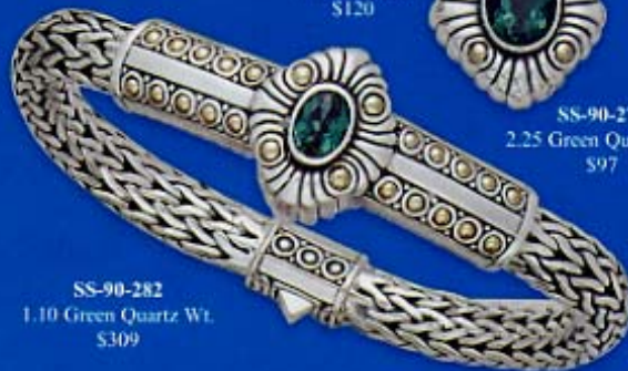
SS-90-282 1.10 Green Quartz Wt. $309