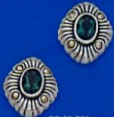
SS-90-280 1.46 Green Quartz Wt. $88