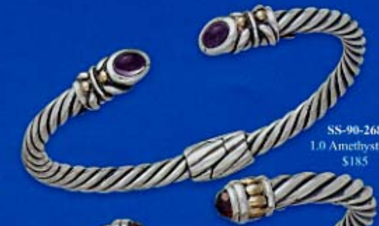
SS-90-268 1.0 Amethyst Wt. $185