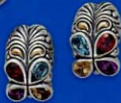
SS-90-272 .68 Amethyst Wt. .90 Blue Topaz Wt. .68 Citrine Wt. .73 Garnet Wt. $222