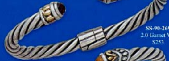
SS-90-269 2.0 Garnet Wt. $253