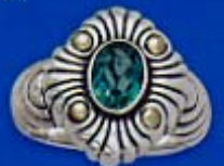
SS-90-281 1.10 Green Quartz Wt. $88