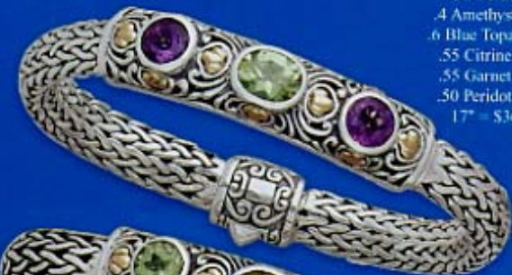
SS-90-266 .4 Amethyst Wt. .6 Blue Topaz Wt. .55 Citrine Wt. .55 Garnet Wt. .50 Peridot Wt. 17" = $360